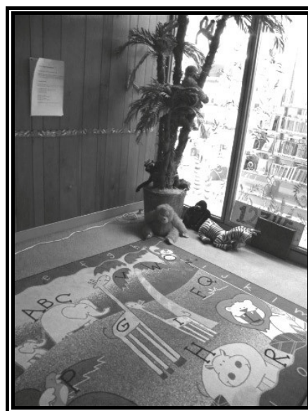
New floor covering for tots area provided by FOL

Your book donations are the life blood of the annual sales sponsored by the Friends of the Library. The spring and fall sales provide most of the income needed to buy non-fiction titles to upgrade and enhance the current library collection. As you enter the library, look to the alcove on the right and see the books purchased last year to honor patrons who purchased special memberships, made generous monetary donations or volunteered their time with daycare reading, homebound delivery or processing books, as well as those who came and helped with the sales.